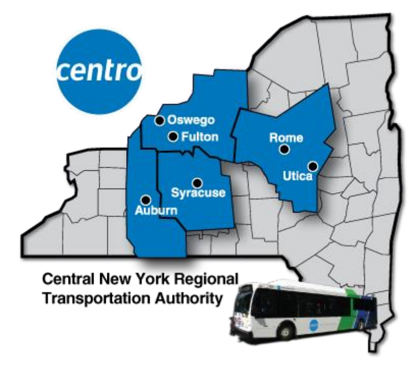
Figure 1: Centro Service Area

For planning purposes, Centro considers its current service area to be the counties of Cayuga, Oneida, Onondaga, and Oswego. Analysis of U.S. Census Bureau 2013-2017 data was conducted to estimate the LEP population in Centro's service area ( see Figure 1 ).